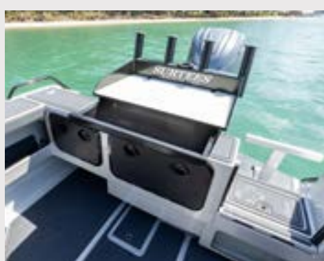
Tidy transom with Live Bait Tank, dry storage and bait station