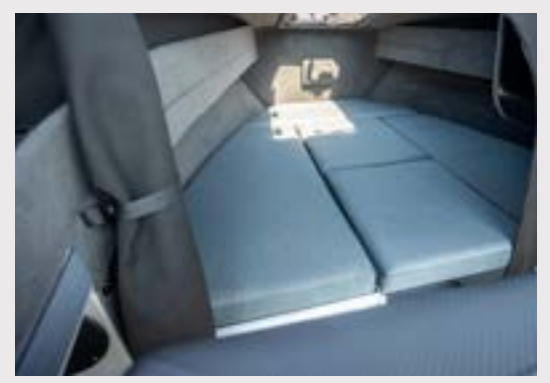
Full cabin seating and optional sleeping infills for added comfort